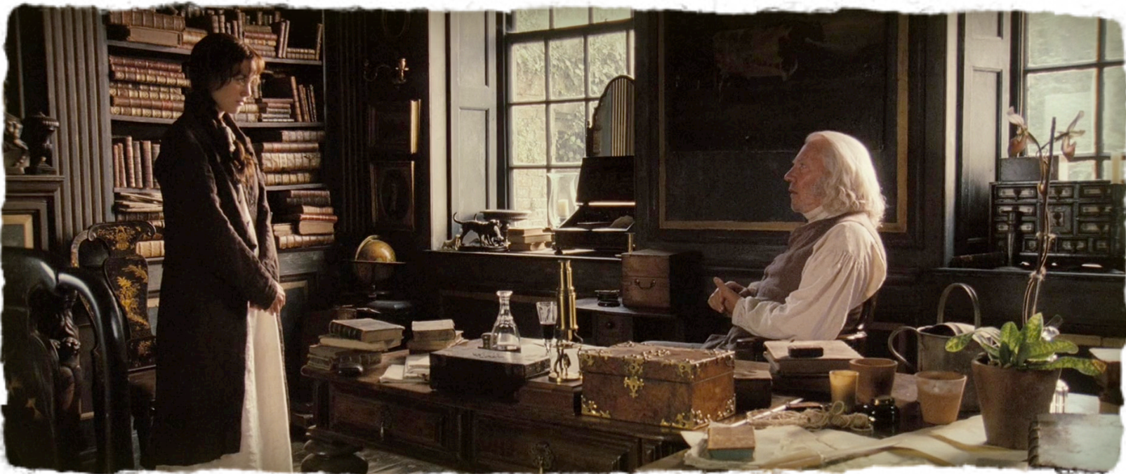
Time Code: 1:56:33